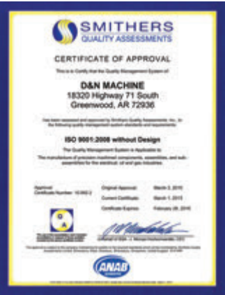
ISO 9001:2008 Certified Company