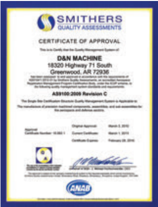
AS9100:2009 Revision C Certified Company