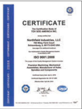
ISO 9001:2008 Certified Company